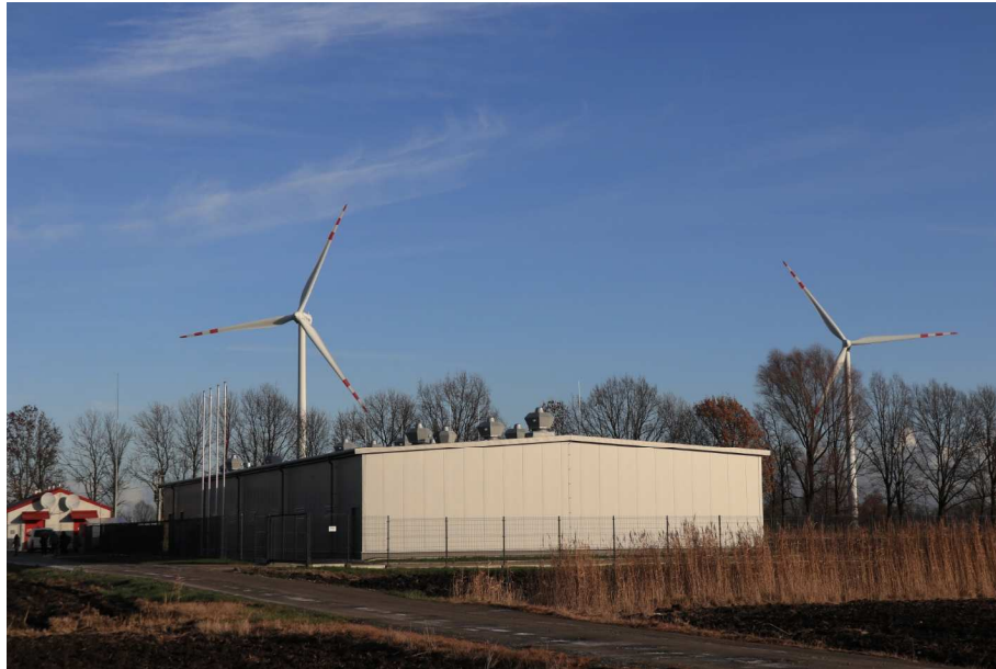
Figure 1. The hybrid BESS building installed next to the Bystra Wind Farm